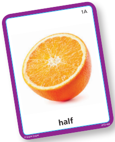
PHOTO Irregular Plurals Fun Deck