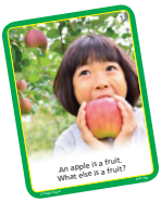
Photo Similarities & Differences Fun Deck